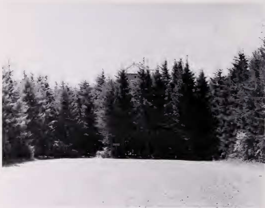
FIG. 2. Gaudineer Knob study area and Fire Tower, June 1978.

somewhat freely through the Christmas-tree-sized spruces. Figure 1 shows the edge of the parking lot and the tower as they were in 1948.